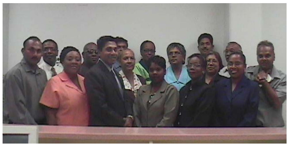
Administrative Staff of the Environmental Commission (From Left to Right)

The Commission's staff also comprises eighteen (18) other members appointed by the Public Service Commission, including clerical staff, Bailiffs, Verbatim Reporters and other support staff. Provision is also made in the establishment for the replacement of the three (3) Verbatim Reporters with two (2) Computer Aided Transcription ("C.A.T.") Reporters when appropriate personnel and equipment have been sourced. The Commission also employs one (1) night watchman and one (1) janitor by temporary contracts pending the award of contracts for these services. Most members of Staff of the Commission have been appointed on a temporary, acting or probationary basis.