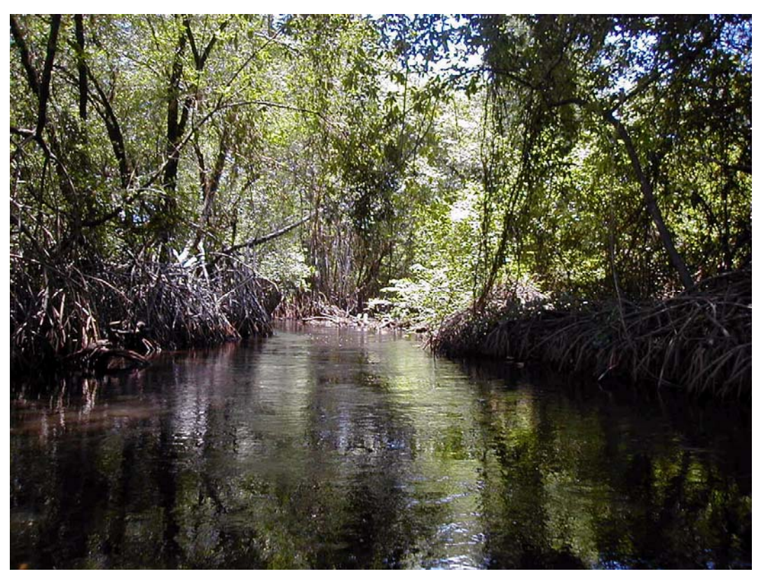
Mangrove Swamp, Trinidad

The Members and Staff of the Environmental Commission remain committed to maintaining the highest standards of service to the Republic in the field of environmental law.