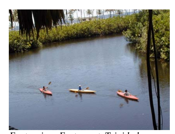
Ecotourism, East-coast, Trinidad

The Commission often receives requests to make presentations with respect to the role, jurisdiction and procedure of the Commission. The Commission endeavours as far as possible to facilitate these requests through the participation of either the Chairman, Deputy-Chairman, Members or Registrar.