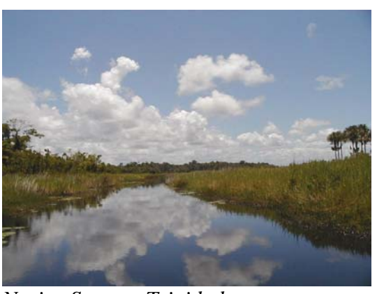
Nariva Swamp, Trinidad

Such approval having been obtained, the Rules of Practice and Procedure were published in the Gazette No. 204 of 2002 dated 29<sup>th</sup> October, 2002 and is referenced as Legal Notice No. 135 of 2002.